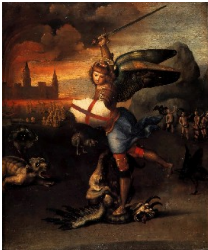
(Rafael: Michael Slaying the Dragon , c. 1504)

Benedicite Domino angeli eius “Bless the Lord, ye His Angels”